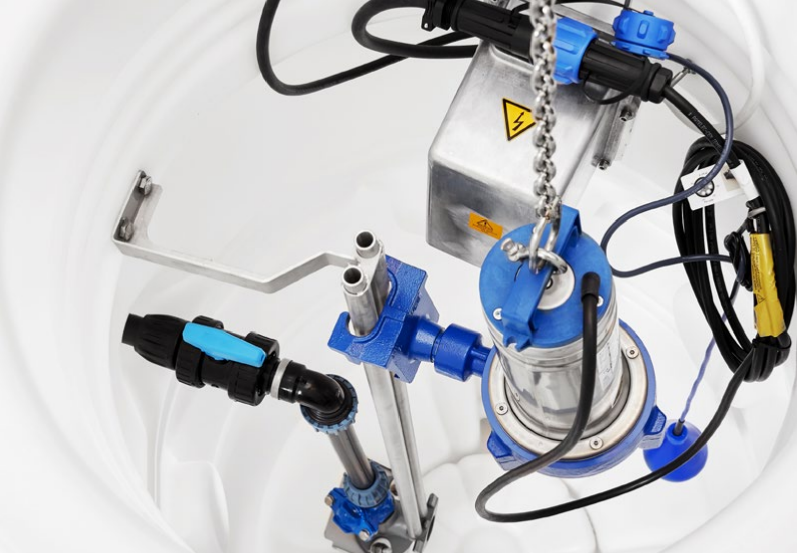
Compit 901 offers hanging installation, H, or guide bar-supported P installation